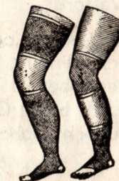
Elastic Surgical Hosiery